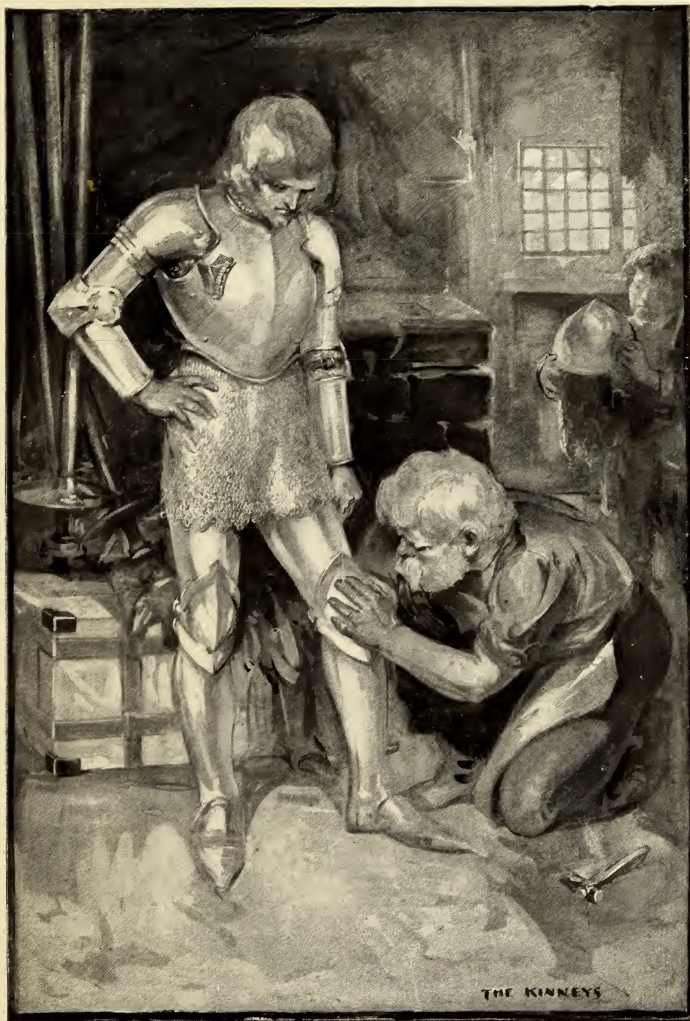
THAT VERY SUIT FOR WHICH HE HAD YEARNED